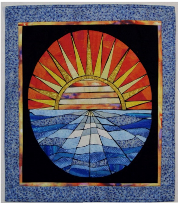
Samples of Kim Brownell's April workshop projects