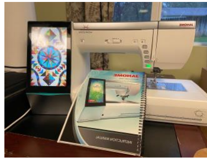
Like New Janome 15000 Memory Craft Embroidery Machine