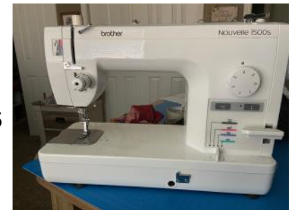
Brother Nouvelle 1500S

Straight stitching only - with extension table and all attachments - $200